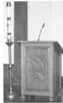
The pulpit depicts the eagle, symbol of wisdom.