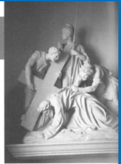
The Stations of the Cross surround the interior walls of the church, showing the story of Christ's passion and death.

The shrines feature the restored wooden statues of Mary and Joseph and the plaster statues of St. Therese and the Sacred Heart of Jesus. There is a repetitive theme of wood-trimmed elliptical and circular arches. The liturgical furniture incorporates elements of this design. The wood carvings are realistic, employing simplicity, which is modern, and symbolism, which is traditional. Some of the relief carvings in oak and obeche wood use the shape of the scallop shell to frame the symbols.