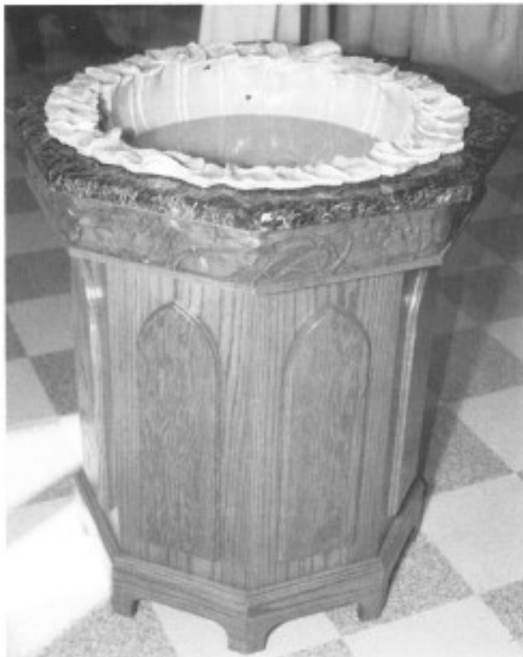
Water lilies border the wooden base and the molded bowl of the baptismal font. The font is located in the center of the fellowship area.